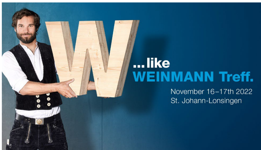
Figure 1: W like WEINMANN Treff — the industry conference for timber construction.

These system concepts will be presented at the WEINMANN Treff and there will also be an opportunity for individual consultation. There will also be live demonstrations of the machines.